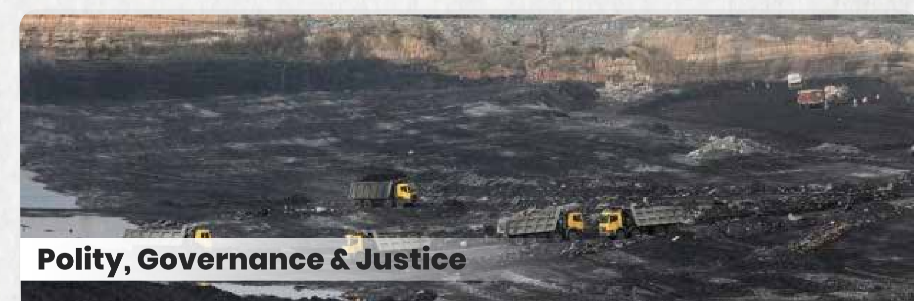
Polity, Governance & Justice