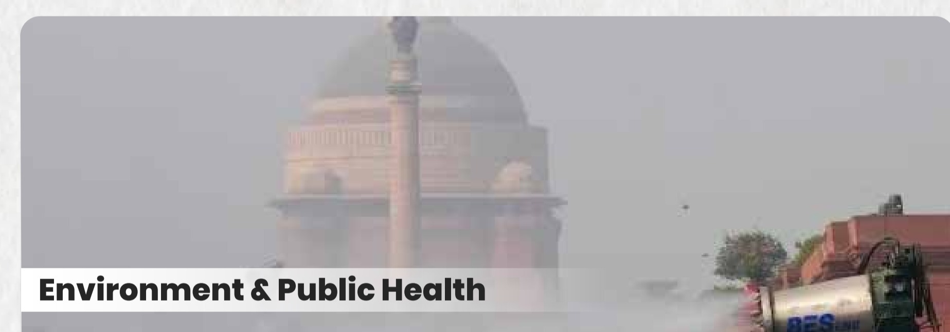
Environment & Public Health