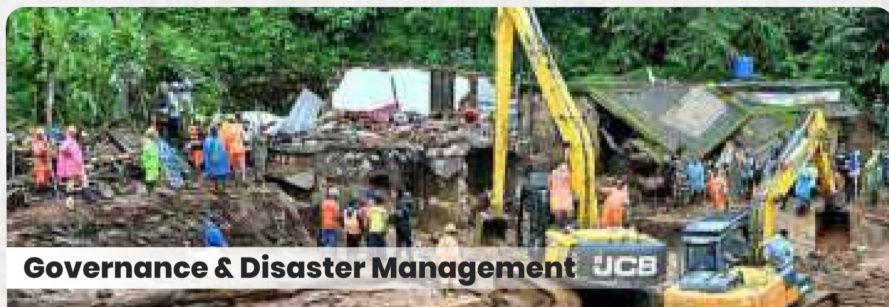
Governance & Disaster Management JCB