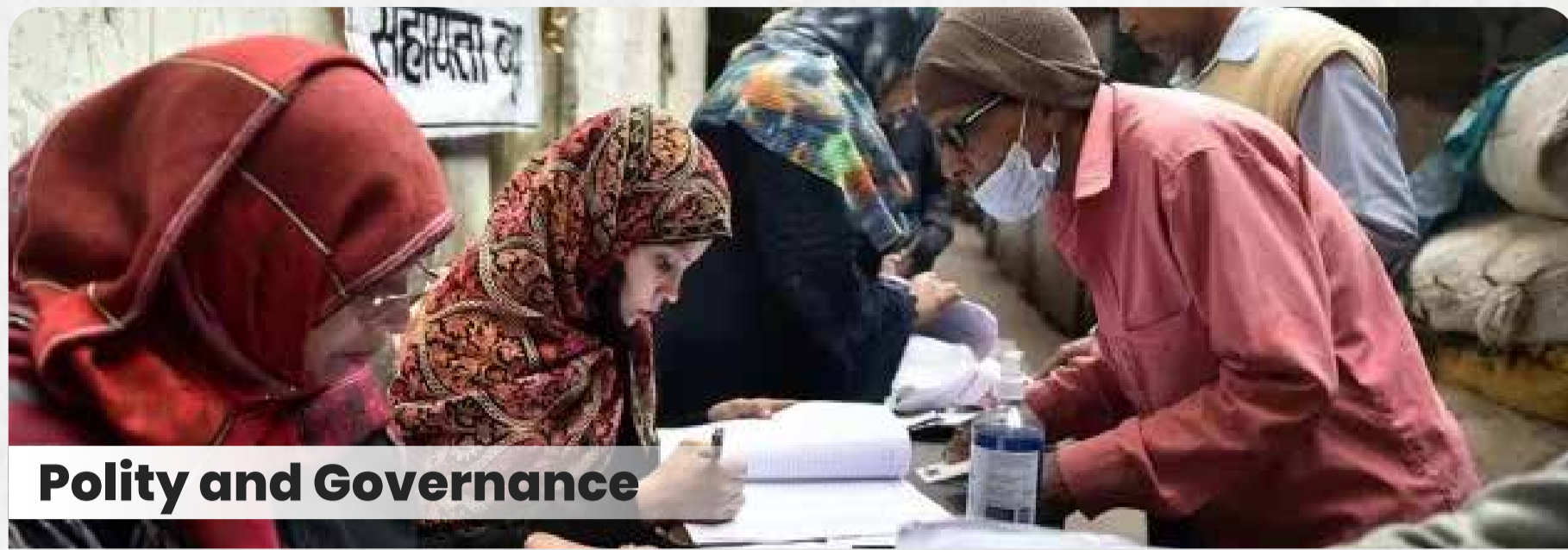
Polity and Governance