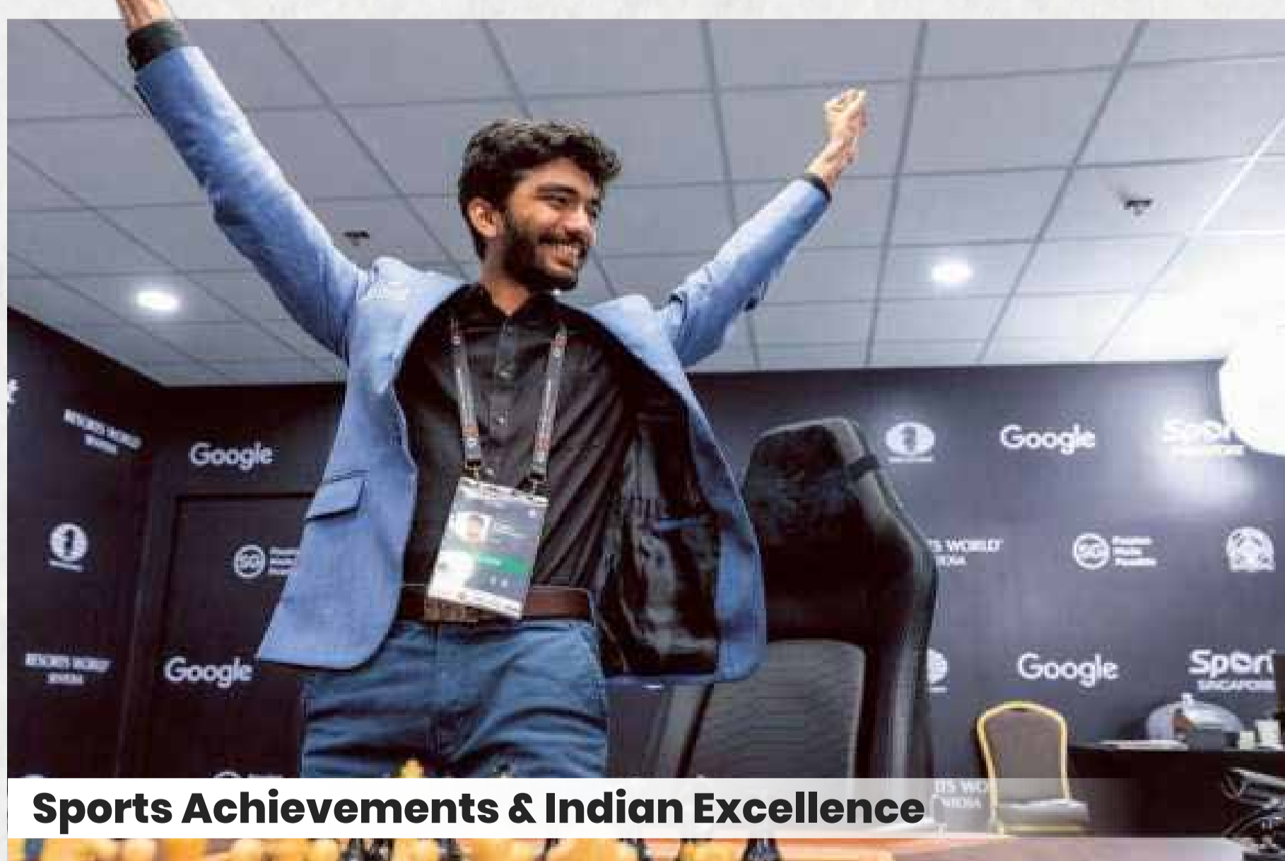
Sports Achievements & Indian Excellence

D. Gukesh, 18, from Chennai, made history as the youngest World Chess Champion by defeating Ding Liren. The match, the first between two Asian players, witnessed Gukesh overcoming an initial loss and capitalizing on Ding's crucial mistake. Gukesh is only the 18th world champion, breaking Garry Kasparov's long-standing record.