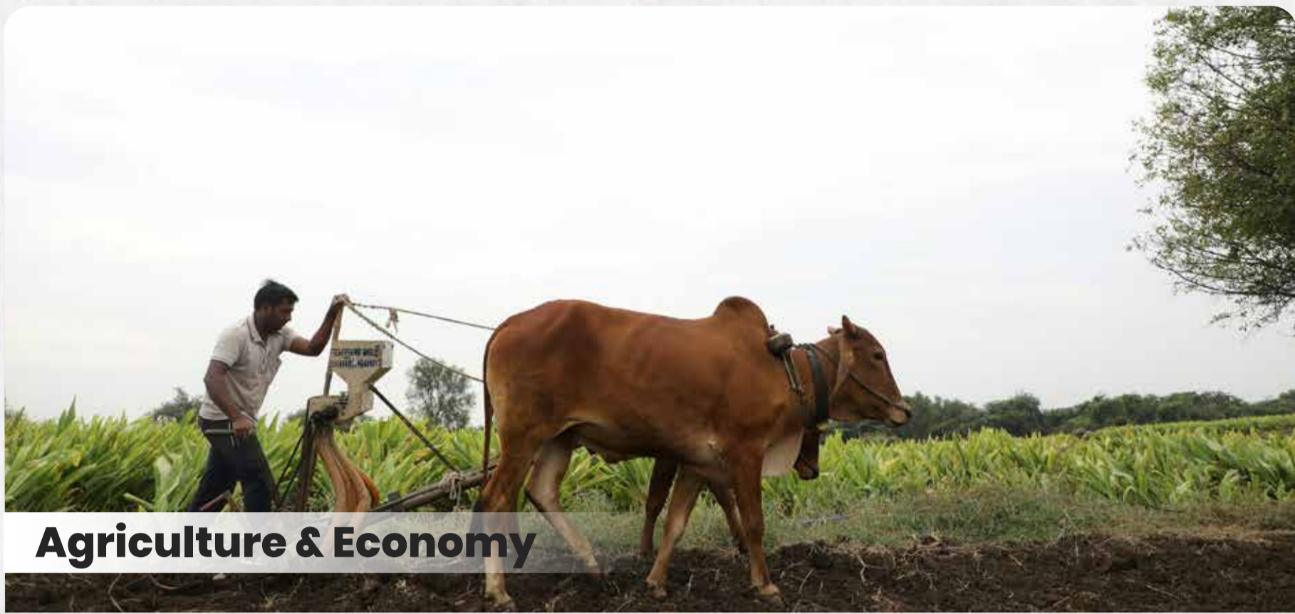
Agriculture & Economy