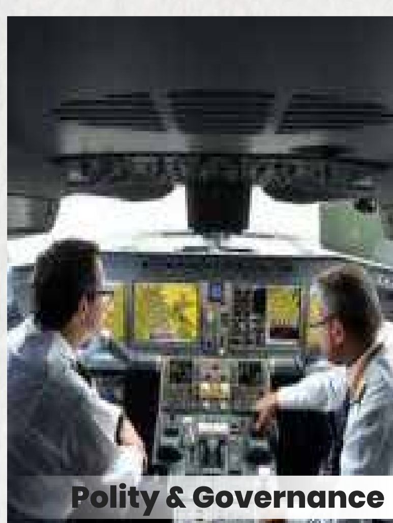
Polity & Governance

The DGCA informed the Delhi High Court that new regulations for pilots, focusing on improved safety standards and operational efficiency, will be enforced starting July 2025. The norms aim to address concerns over pilot fatigue, training protocols, and work conditions. The court welcomed the timeline while monitoring implementation progress.