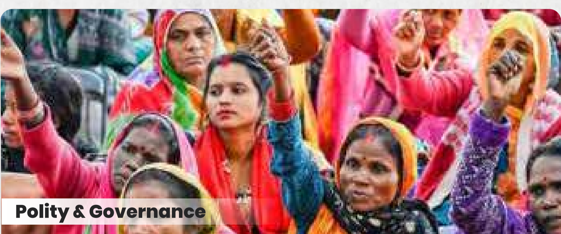
Polity & Governance