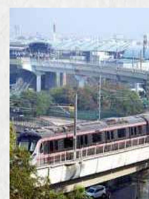
Economy & Infrastructure

The 26.46-km Rithala-Narela corridor, costing ₹6,230 crore, aims to boost connectivity across NCR. The project is set for completion in four years, adding 21 elevated stations to the metro network.