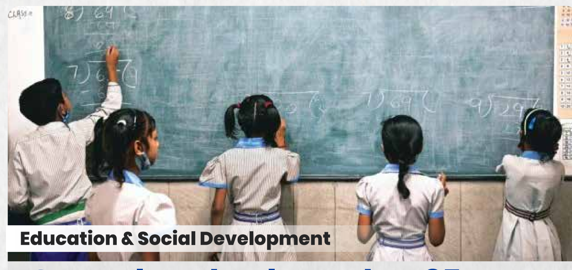
Education & Social Development