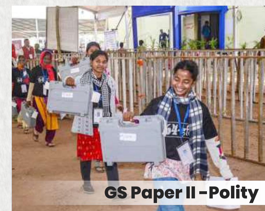
GS Paper II - Polity

The Supreme Court dismissed a plea for reintroducing paper ballots, emphasizing EVMs' reliability. The court highlighted the hypocrisy in EVM criticism based on election outcomes.