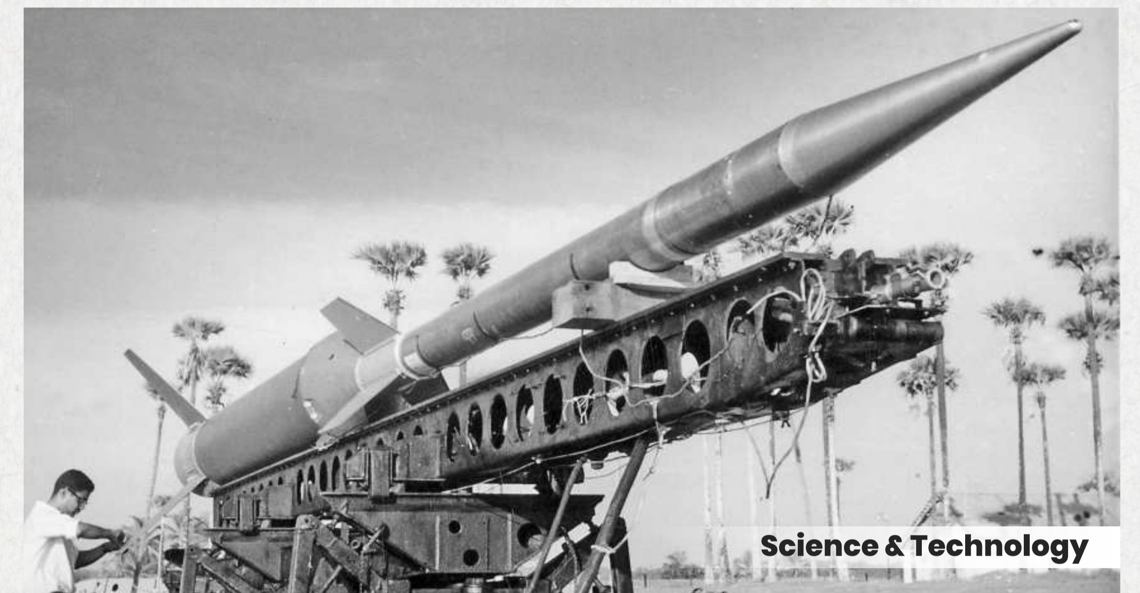
Science & Technology

Marking 60 years since the historic Thumba rocket launch, India's private space sector is now poised for growth with startups and private firms competing in satellite launches and other innovations. This transition highlights ISRO's role in enabling private participation in space technology. Key companies are focused on cost-effective solutions and global collaborations, ushering in a new era of Indian space exploration.