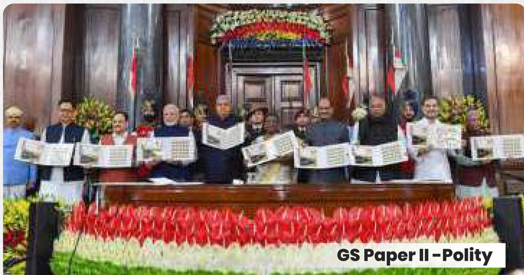
GS Paper II - Polity