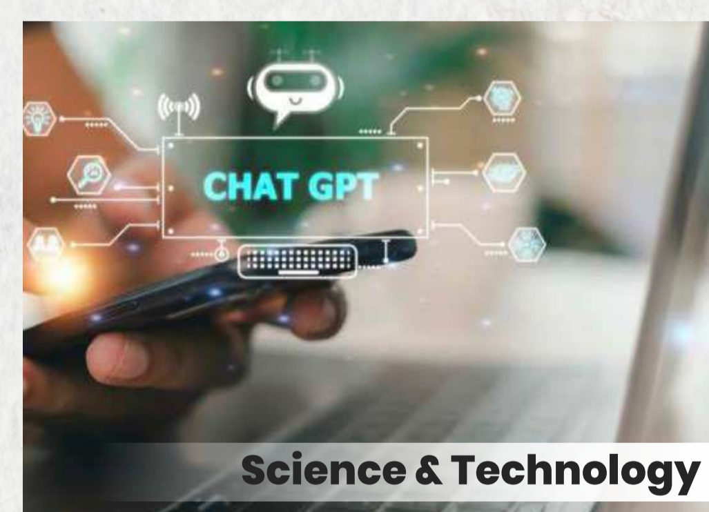
Science & Technology

Companies are increasingly integrating artificial intelligence into operations but are moving cautiously to mitigate risks. The focus lies on leveraging AI for efficiency, personalization, and data analysis while addressing concerns about ethics, security, and workforce impact. Experts highlight that a steady approach is critical for building trust and ensuring long-term success in the AI-driven market.