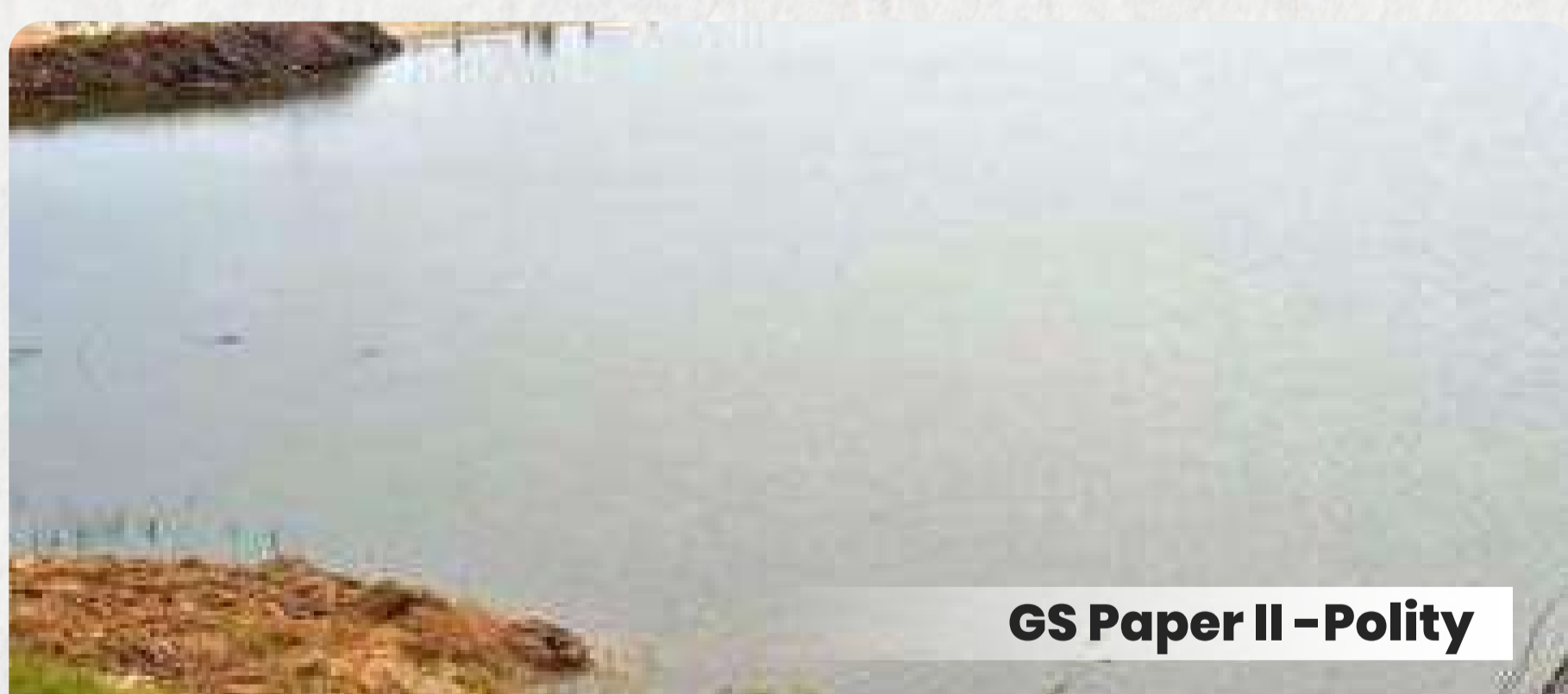
GS Paper II - Polity