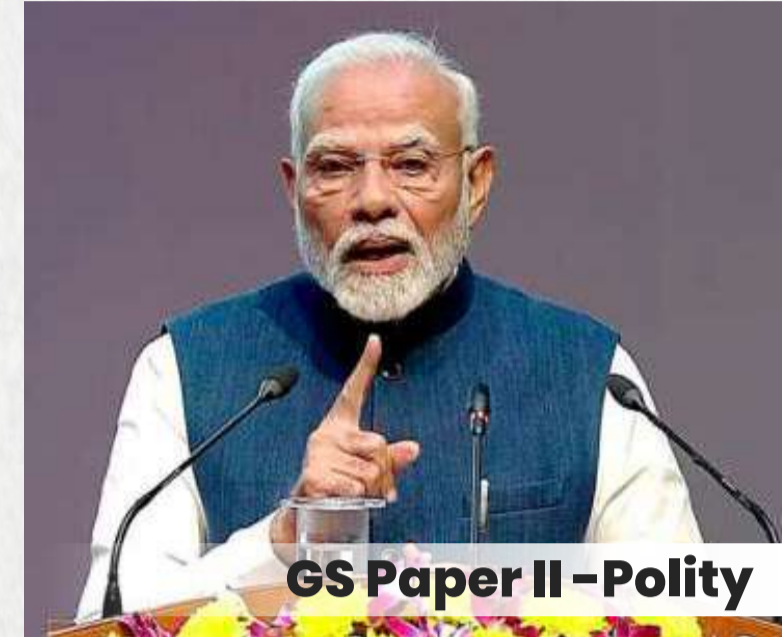
GS Paper II - Polity

Prime Minister Narendra Modi, at an event marking the 75th anniversary of the adoption of the Constitution, described the document as a "living stream" guiding the nation. He credited the Constitution for enabling India's progress and safeguarding citizens' rights. Modi emphasized the importance of prioritizing the nation above all else to sustain the Constitution for centuries. Speaking at the Supreme Court, he reflected on the enduring relevance of the Constitution in fulfilling the aspirations of citizens and uniting the country's diverse elements.