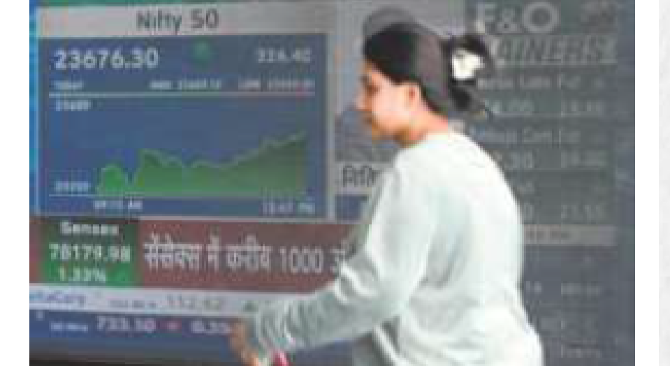
A woman walks past a digital broadcast screen at the Bombay Stock Exchange on Friday.

Some Adani stocks see mild recovery after the drubbing